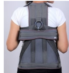
Tailor Brace - Spinal Support