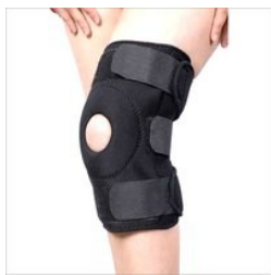
Knee Support Open Patella