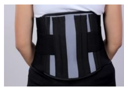
Lumbo Sacral Support Belts