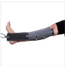
Leg Traction Kit