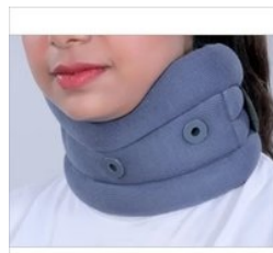
Cervical Collar Soft