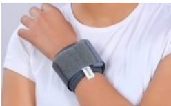
Neo Wrist Binder