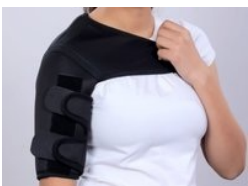
Dritex Shoulder Support