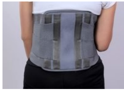
Countered LS Belt