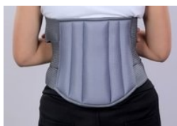
Lumbar Sacral Support