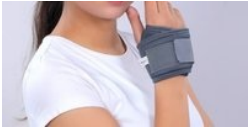
Neo Thumb Binder