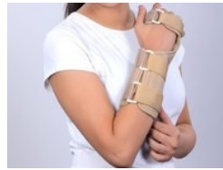
Four Arm Splint