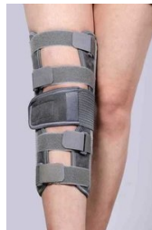
15 Inch Short Knee Brace